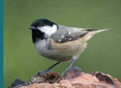
Coal Tit, by Jill Pakenham

The modern approach to garden bird feeding is to use a range of foods that meet the nutritional requirements of a wide range of species over the course of the year.