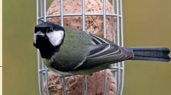
Great Tit, by Jill Pakenham

Many garden birdwatchers provide sunflower hearts, mixed seed and peanuts as their staple foods and these are well used by sparrows, tits and finches. There are also other foods, e.g. sultanas, that are good for ground-feeding Blackbirds, while pinhead oats are ideal for fine-billed Dunnocks. Finely grated cheese and windfall apples are also useful, as are the various fat-based products, best provided free of any netting.