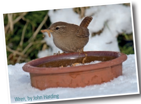
Wren, by John Harding

Research shows that birds make decisions about what foods to take and when. In years when natural seed crops are poor, we see increased use of bird tables and hanging feeders.