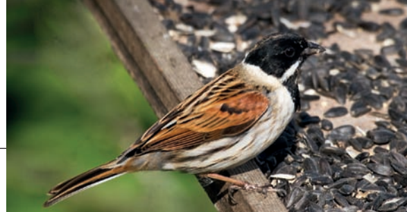
Reed Bunting at black sunflower seeds

It is better to have a number of smaller feeders dotted around the garden than a single large feeder. Not only does this allow birds to feed under less competitive conditions, it also allows