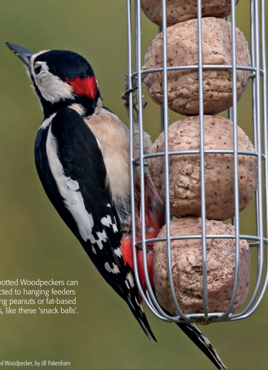
Great Spotted Woodpecker, by Jill Pakenham

Great Spotted Woodpeckers can be attracted to hanging feeders containing peanuts or fat-based products, like these 'snack balls'.