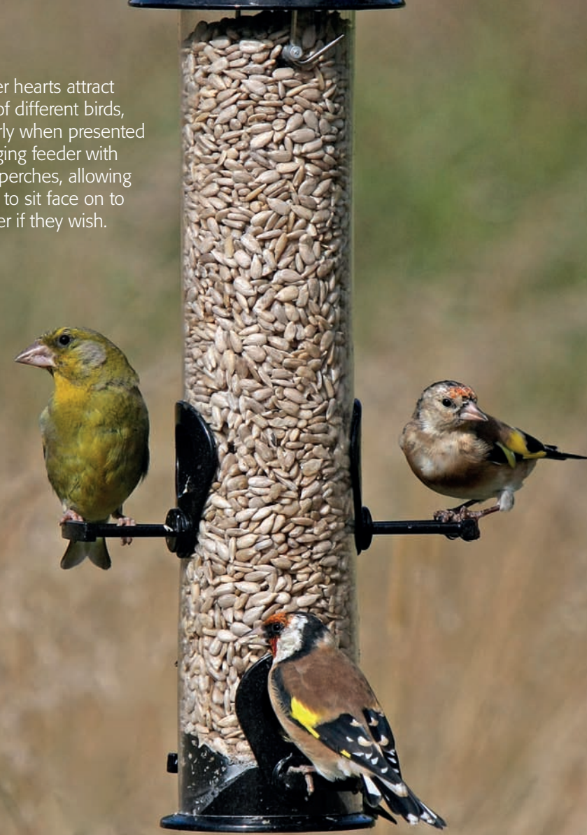
Greenfinch and Goldfinches, by Jill Pakenham

Sunflower hearts attract a range of different birds, particularly when presented in a hanging feeder with modern perches, allowing the birds to sit face on to the feeder if they wish.