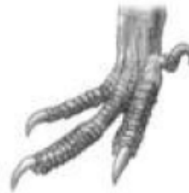
5. Running & scratching